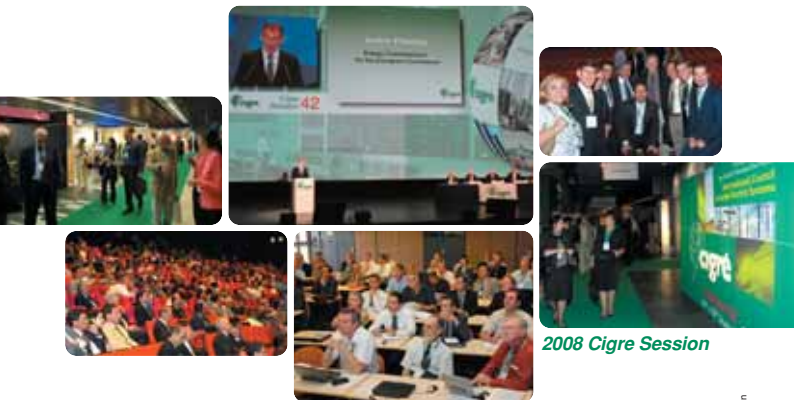
2008 Cigre Session