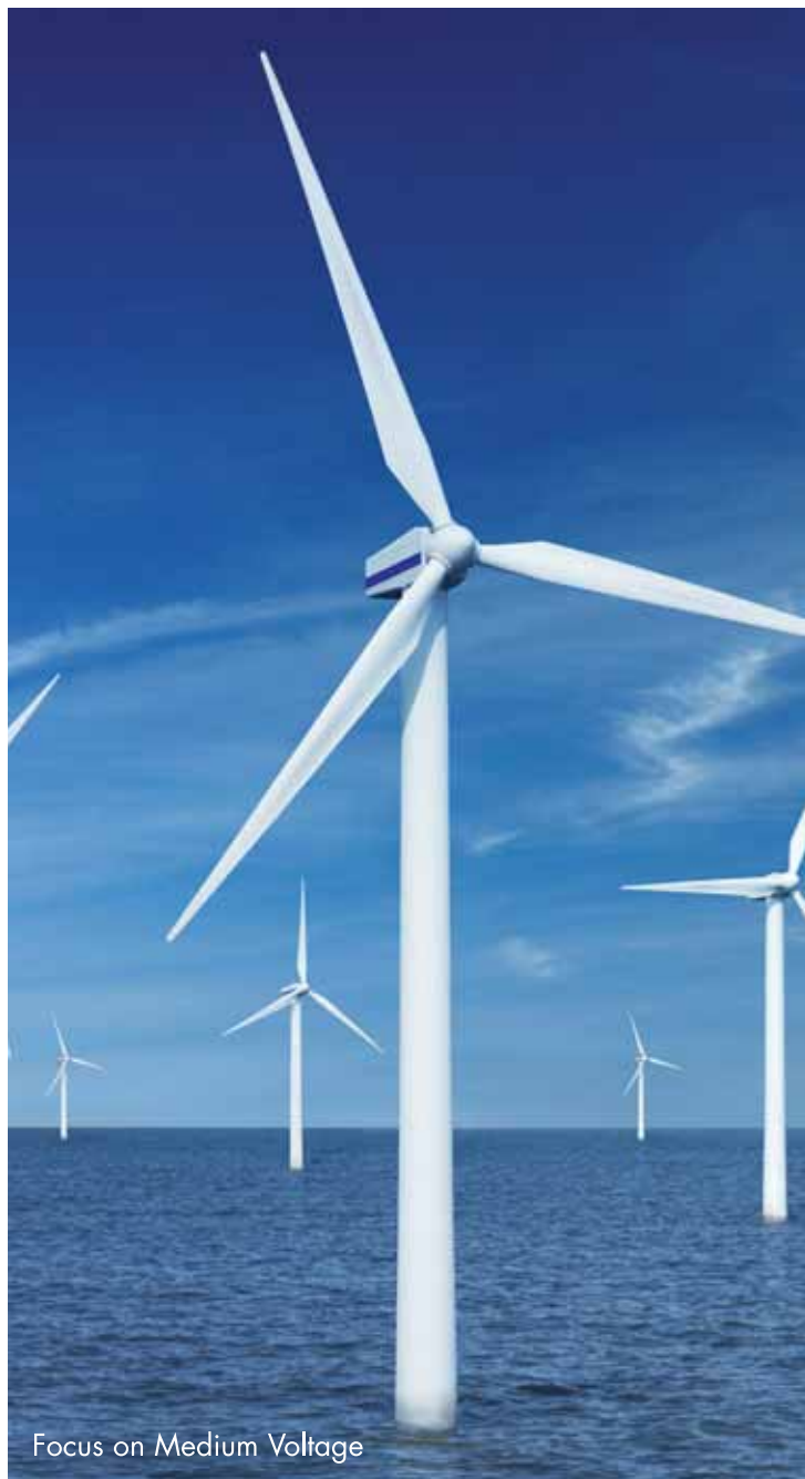
Focus on Medium Voltage

The CEO Forum will kick-off with an EURELECTRIC Award presentation.